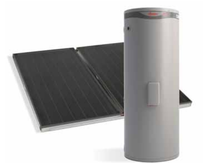
Model No: 511325/2NPT

Solar water heaters work by absorbing energy from the sun's rays in roof mounted solar collectors. This energy is transferred to heat water stored in the storage tank. Ground mounted systems rely on inbuilt pumps to push the water through the system. Typically water passes through channels in the solar collector where the water is heated. As the water moves out of the collector and into the tank, the tank gradually gets hotter until the water reaches its maximum stored temperature.