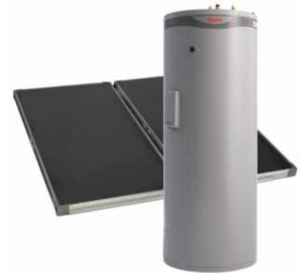
Model No: 591270/2T

Indirect models are designed for frost prone areas and work in much the same way as direct models but rather than heating water 'directly' in the solar collectors, heat exchange fluid with anti-freeze properties is heated. This in turn 'indirectly' heats the water. Indirect heating prevents water freezing and damage to collectors.