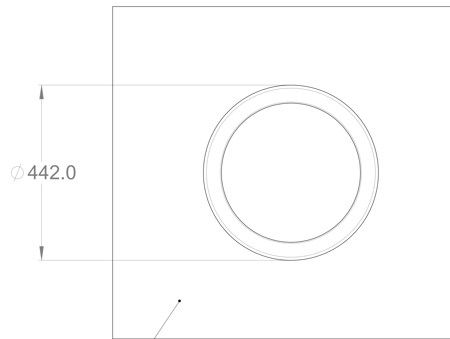
GYPROCK CEILING VIEW A Underside